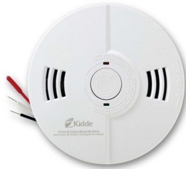
Front of unit with wire connectors

Under certain circumstances, the alarm can fail to continue to chirp when it reaches its end of life (after seven years), leading consumers to believe that it is still working.